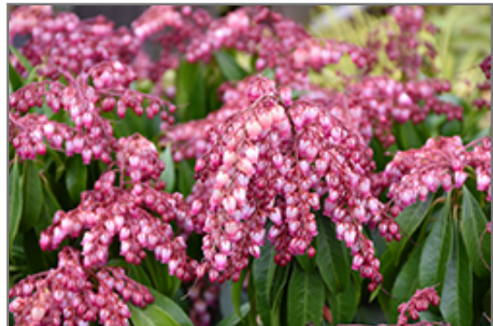
Katsura Japanese Pieris flowers

Katsura Japanese Pieris is recommended for the following landscape applications;