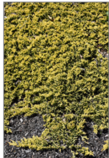
Mother Lode Juniper foliage