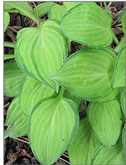
Emerald Tiara Hosta foliage