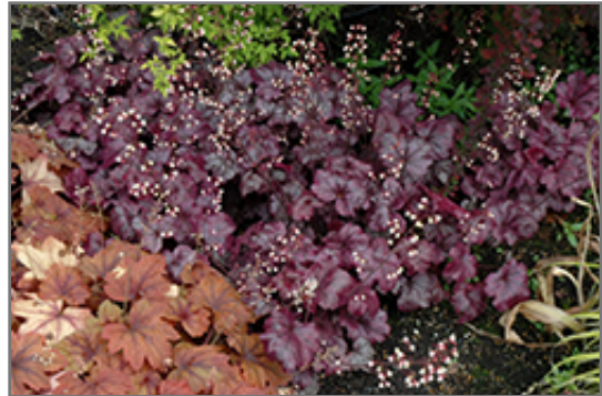
Plum Royale Coral Bells in bloom