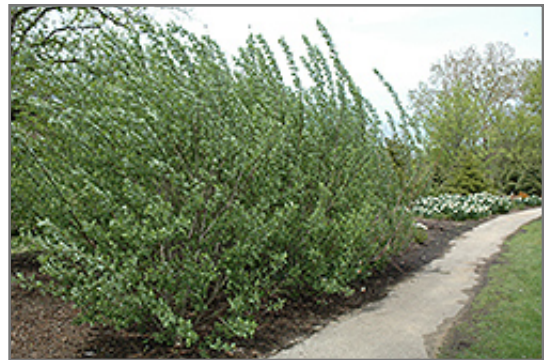
French Pussy Willow