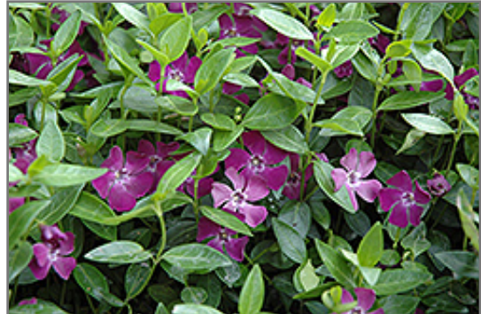
Burgundy Periwinkle flowers

Burgundy Periwinkle is recommended for the following landscape applications;