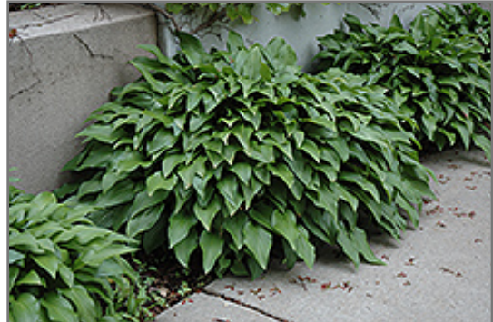
Invincible Hosta