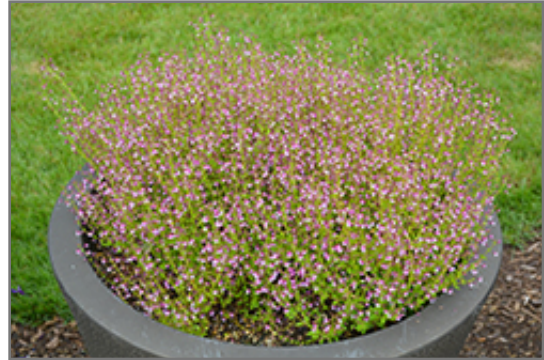
Fairy Dust Pink Cuphea in bloom

Fairy Dust Pink Cuphea will grow to be about 12 inches tall at maturity extending to 16 inches tall with the flowers, with a spread of 15 inches. When grown in masses or used as a bedding plant, individual plants should be spaced approximately 10 inches apart. Its foliage tends to remain dense right to the ground, not requiring facer plants in front. Although it's not a true annual, this plant can be expected to behave as an annual in our climate if left outdoors over the winter, usually needing replacement the following year. As such, gardeners should take into consideration that it will perform differently than it would in its native habitat.