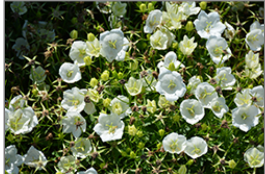
Rapido White Bellflower flowers