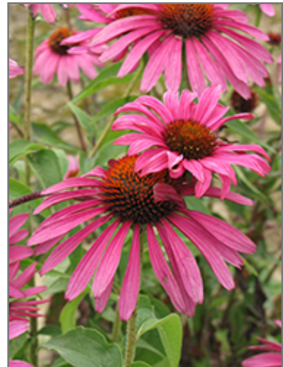
Ruby Star Coneflower flowers