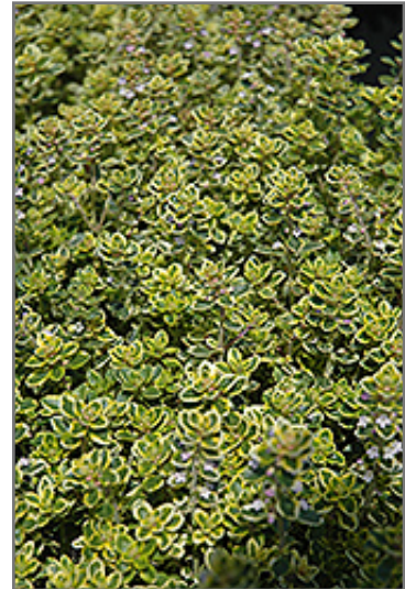
Lemon Thyme foliage