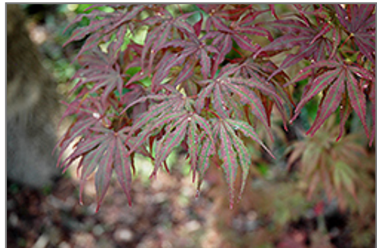
Mikazuki Japanese Maple foliage