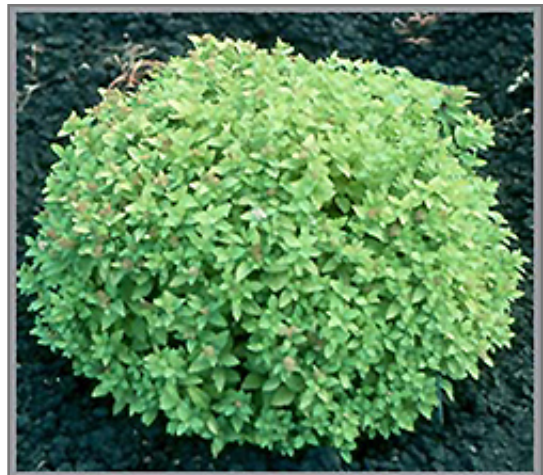
Dakota Goldcharm Spirea